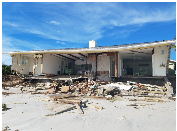
Figure 1 - Loss Site After a Hurricane

OSHA requires a written certification that the hazard assessment has been performed. While there is no requirement that the hazard assessment itself be in writing, most professionals recommend that written documentation of the actual assessment should be a best practice.