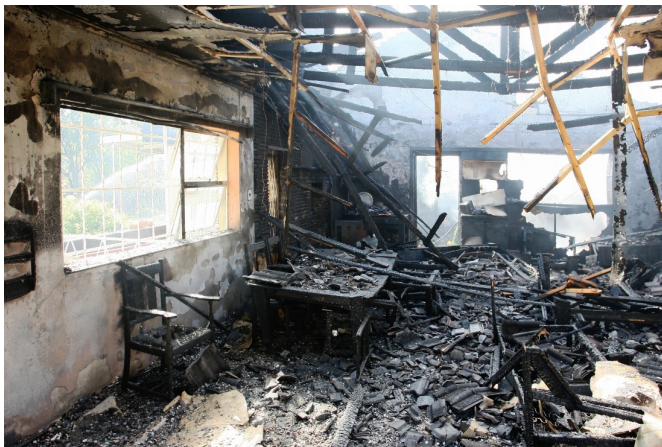
Figure 2 - Loss Site After a Structural Fire